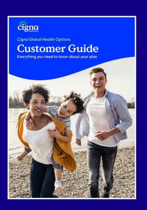
Customer Guide Learn how your plan works and see all the benefits you have access to.